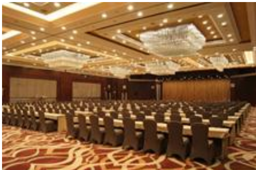
ISPRS Symposium Venue