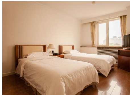
Hotel during Symposium