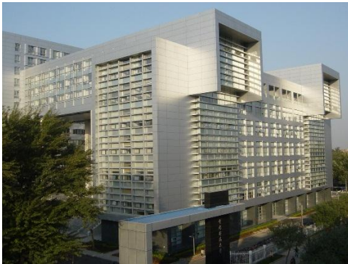
Campus of the CNU